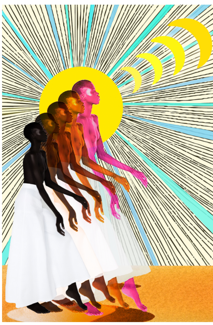
Sun and Rising

A curated survey of this month's "TOP TEN ARTISTS NYC NOW" from our Art 511 Magazine digital artist database. Coming soon, top featured artists from Los Angeles, San Francisco and more! Submit your work to be considered.