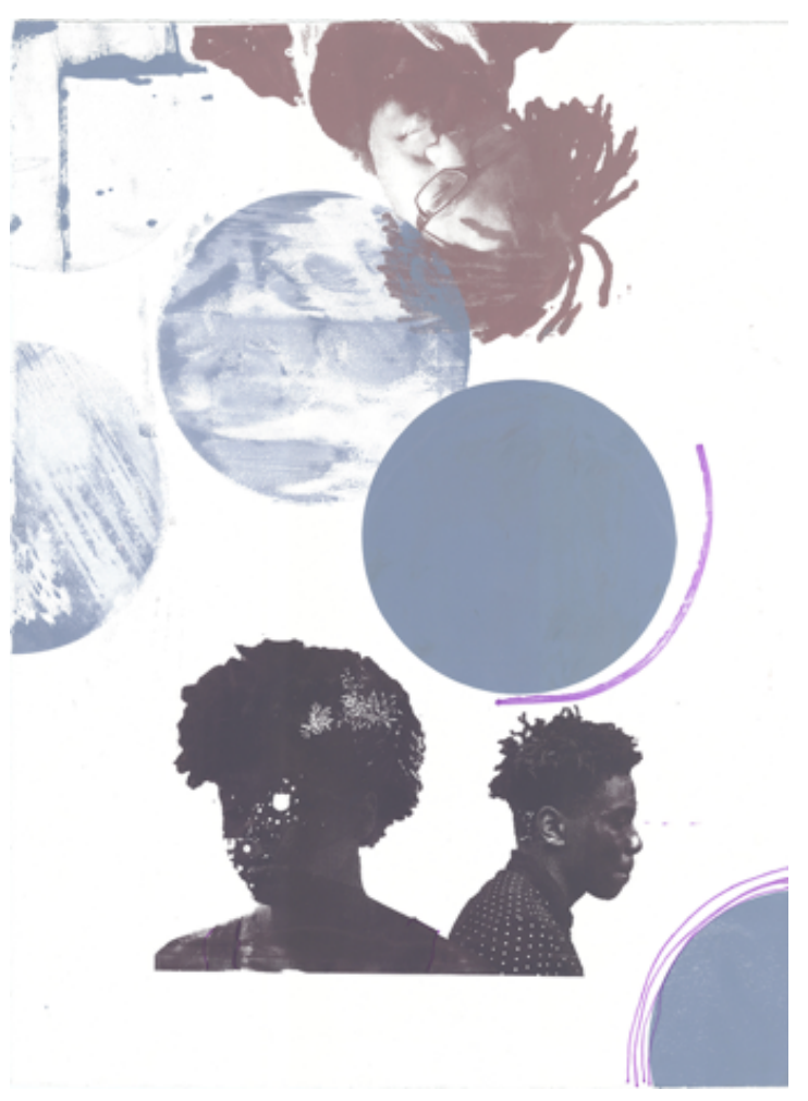
Artworks are combined cyanotype and screen-printing techniques