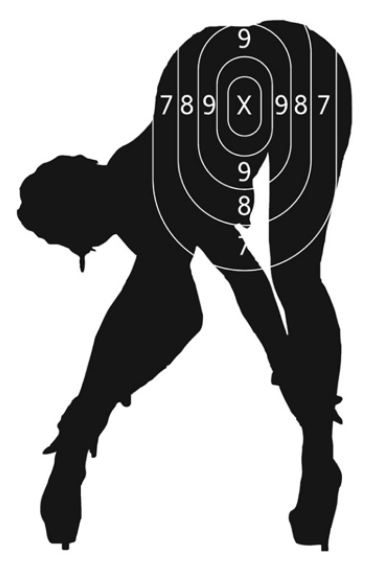
Target #14 digital print on paper 2006